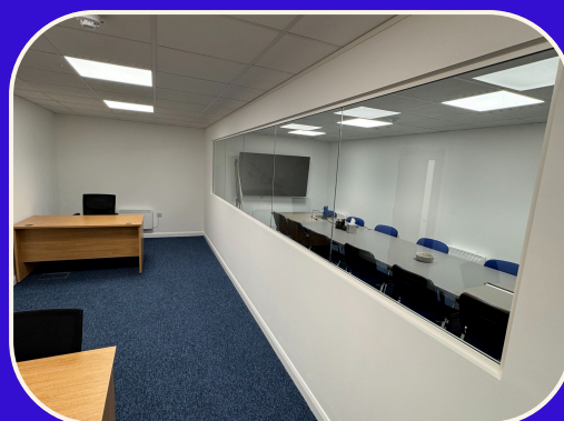
OFFICE REFURBISHMENT COMPLETED