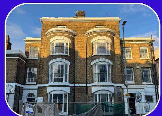
HMO PROJECT STARTED