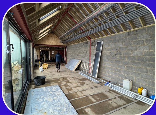
LARGE RESIDENTIAL ELECTRICAL INSTALL